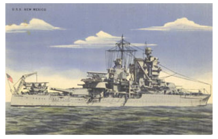
Vintage postcard shows the battleship USS New Mexico

Plus, 2019 Officers, Board Members To Be Elected During EMHS Annual Meeting Sunday, Nov. 11